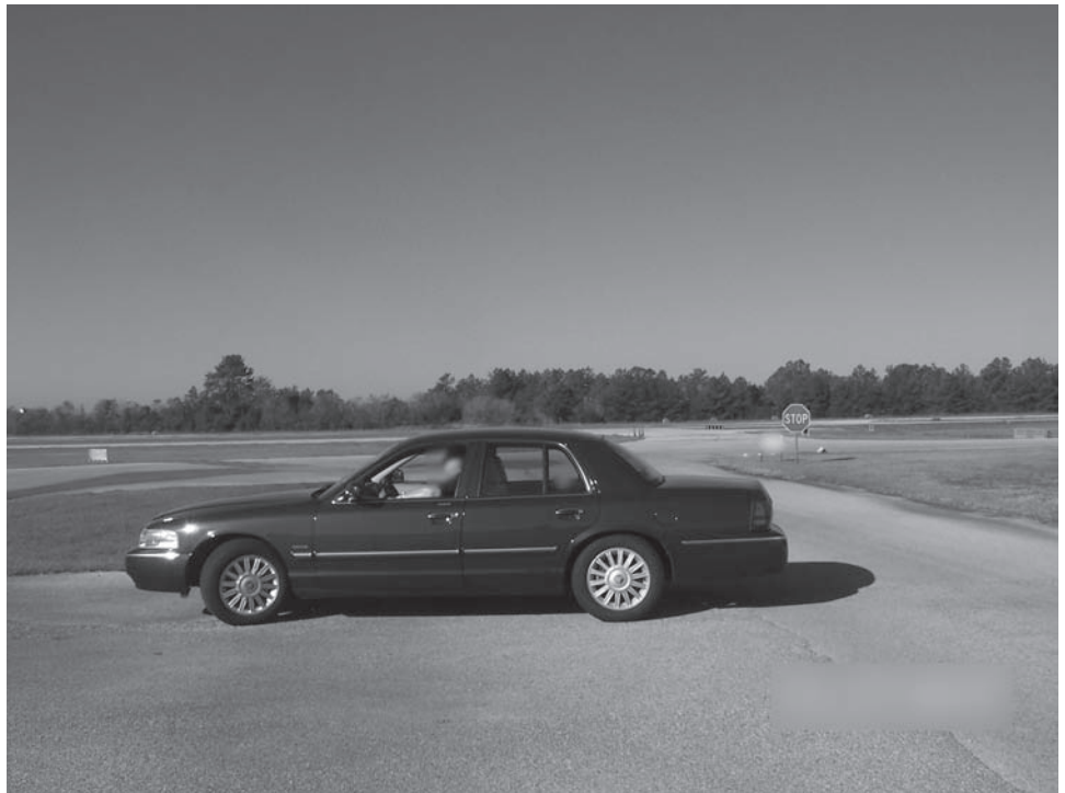
Figure 2: At Airport without Perimeter Fencing, GAO Investigators Accessing Airport Runway by Car and Approaching Jet Aircraft