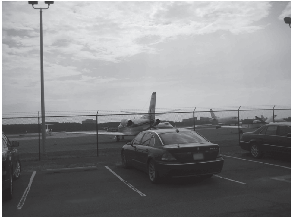
Figure 5: Perimeter Fencing Located Next to a Parking Lot