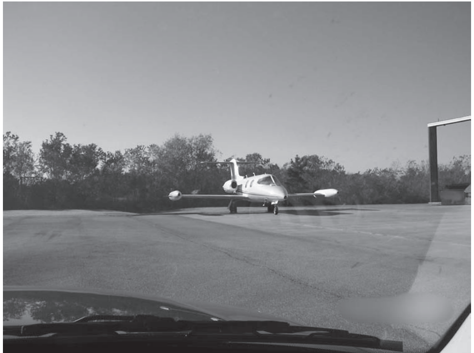
Figure 3: Photo of Jet Aircraft Taken from GAO Investigators' Car