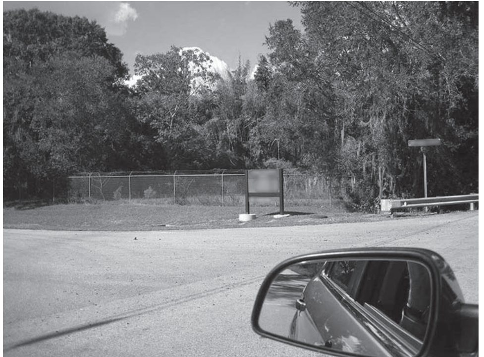
Figure 4: Perimeter Fencing Located Next to Trees