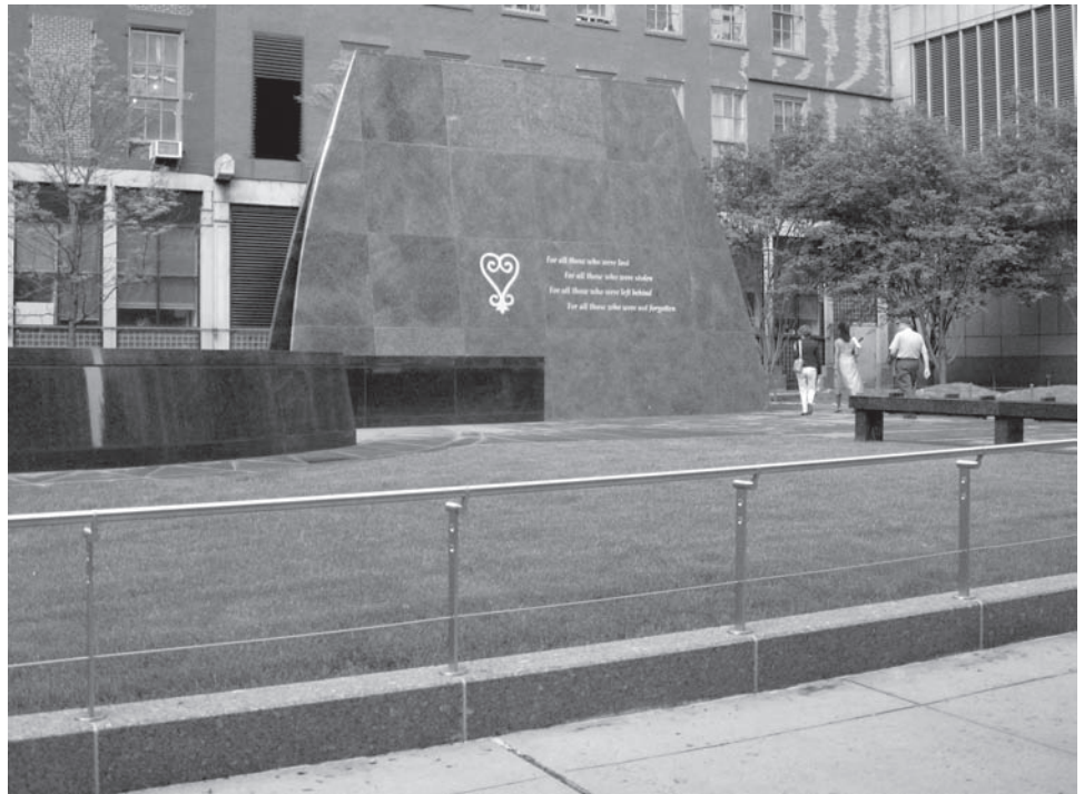
Figure 1: Perimeter Fencing at the African Burial Ground