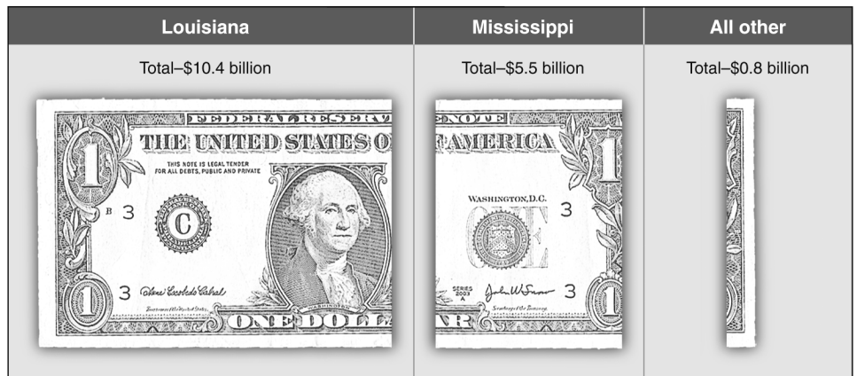
Figure 1: Breakdown of Total CDBG Allocations to Gulf Coast States