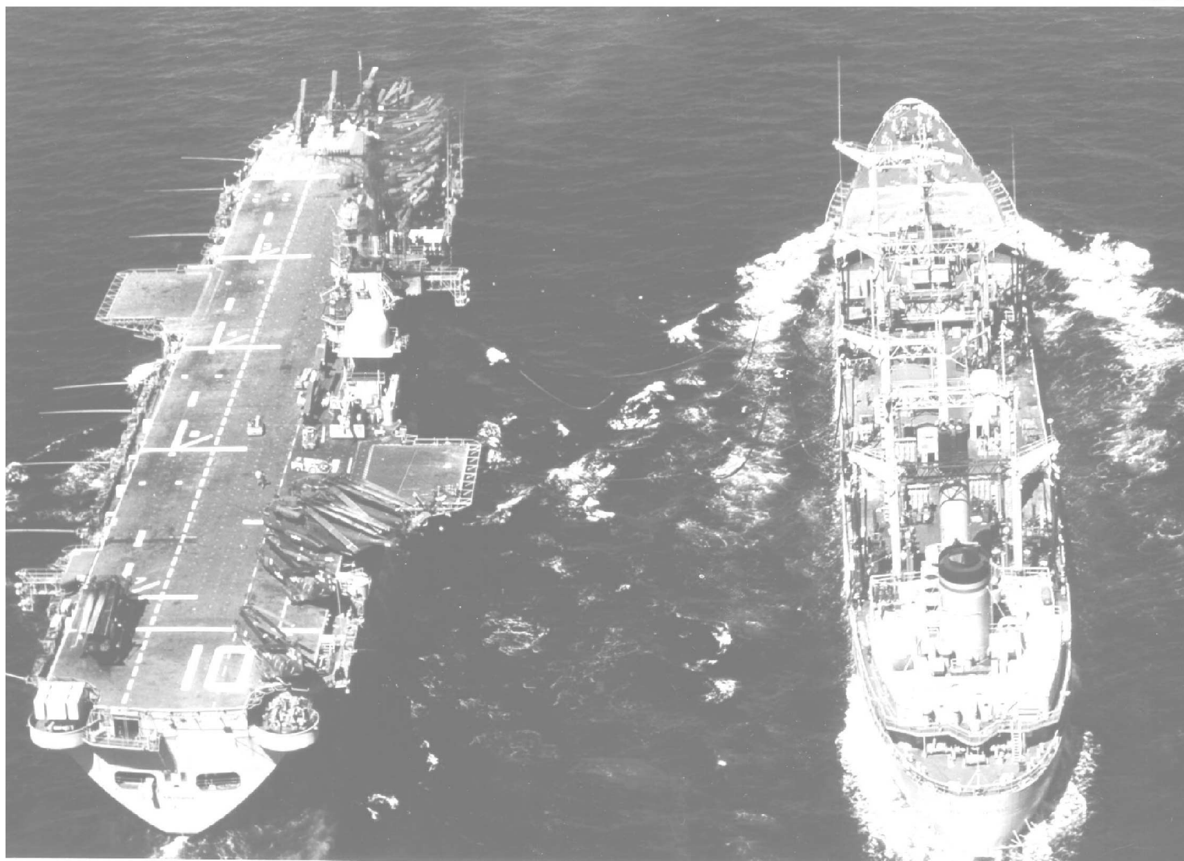
Figure 20-5.—Civilian-operated MSC oiler refueling an LPH.