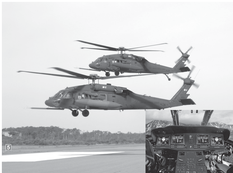
Early developmental testing is producing encouraging results for aircraft performance and cockpit design.