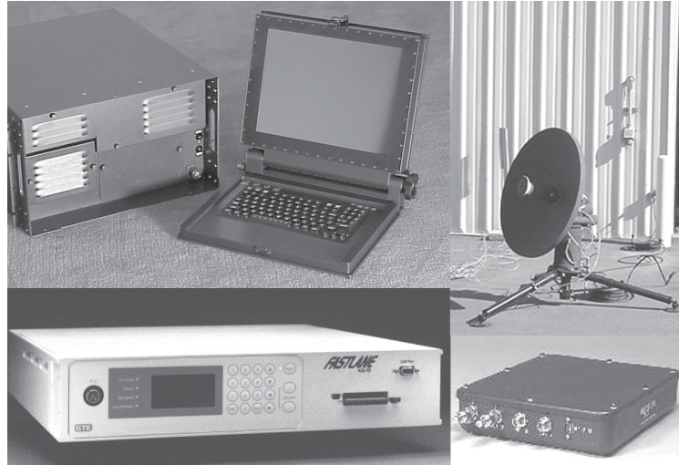
GBS consists of a space segment, fixed and transportable transmit suites, and fixed and transportable receive suites.