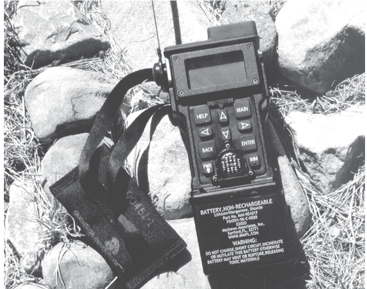
The hand-held radio uses line-of-sight UHF/VHF voice, rescue beacon, GPS, and over-the-horizon data modes for worldwide coverage.