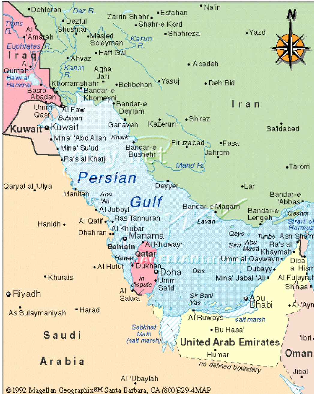
Figure 1. Map of Arabian (Persian) Gulf 1