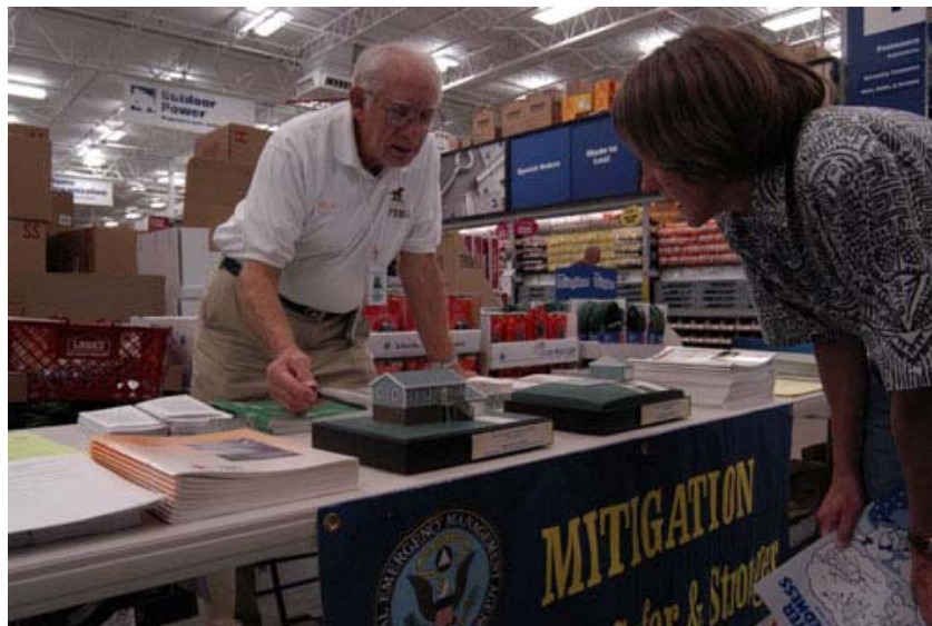
Elizabeth City, NC, October 9, 2003 – A FEMA Mitigation Specialist explains to a victim of Hurricane Isabel how elevating one's house will help to alleviate damage from future hurricanes.