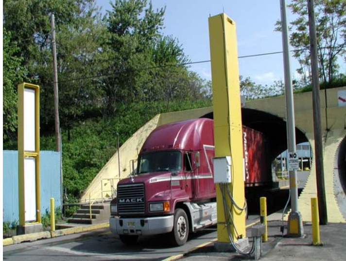
TEST-BED VENUE DEPLOYMENT OF RADIATION PORTAL MONITORS