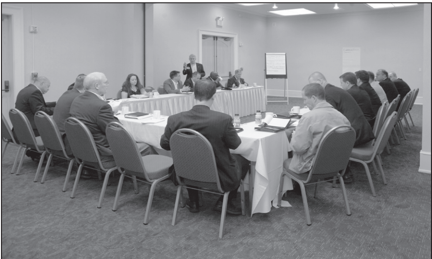
Breakout Group Session

The moderators from all six groups reported candid and enthusiastic exchanges that reflected the perspectives of the individual countries while seeking to understand both the complexities and consequences of the individual issues. The following is a summary of the breakout group discussions and report.