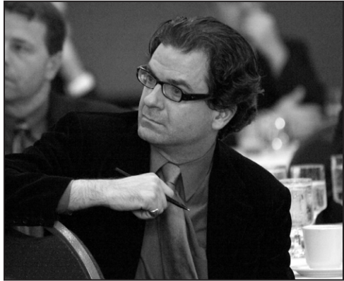
Mr. Peter Bergen

However, Mr. Bergen argues, Al Qaeda does have significant influence on events in Afghanistan and Pakistan and a continued capacity to carry out attacks against the West, particularly in Europe and other centers of western influence (e.g. businesses, hotels, and citizens around the world). He noted that Al Qaeda is nearly dead in Iraq because of a suicide assisted by SOCOM.